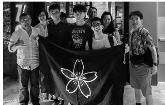
Oyukai in Hawai'i 2