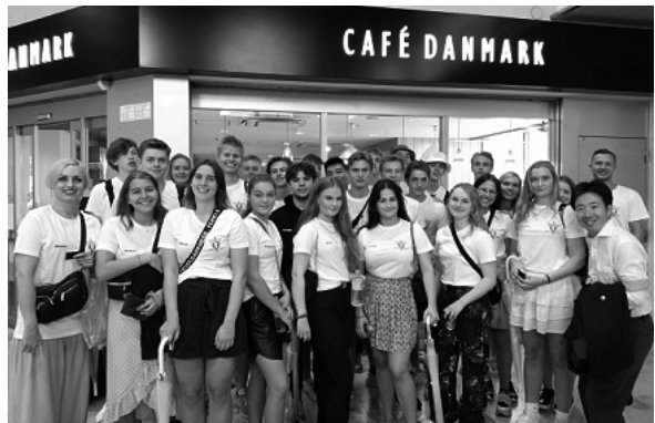
Students and teachers from N. Zahles Gymnasieskole