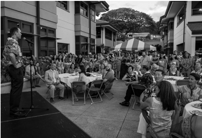
Luau at Punahou

Reading the brief reflections of the participants answering the post SGLI question on the discussion response of High School SGLI 2019 on CANVAS 3 , we can find most students write that one of the best memories is to make friends with high school students from different countries and regions.