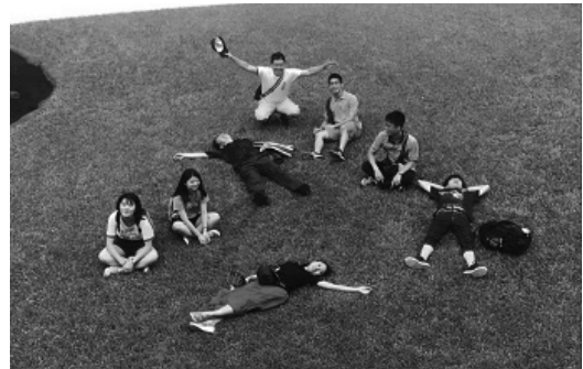
Japanese Garden in UH Manoa