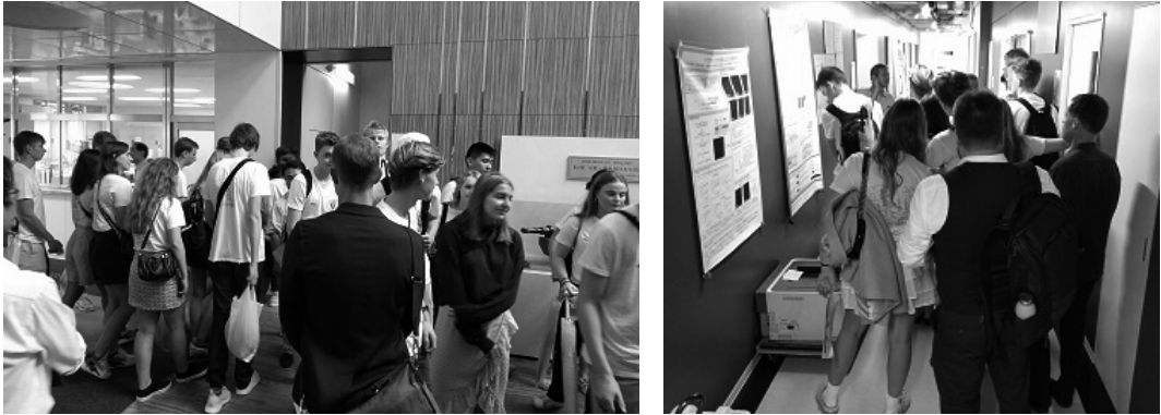
Science Department, Gakushuin University

Danish students, teachers and the professor. The Planning Division of Gakushuin warmly welcomed the guests from Denmark with the four professors in the science department.