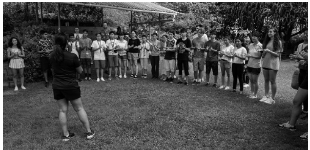
Makapu'u Lighthouse trail hike & its practice of singing "E Ala E"