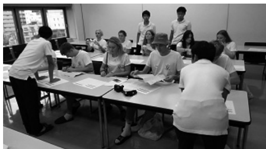
Miura Ori folding