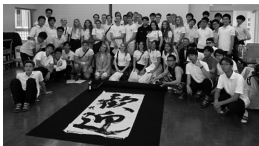
Group photo 1