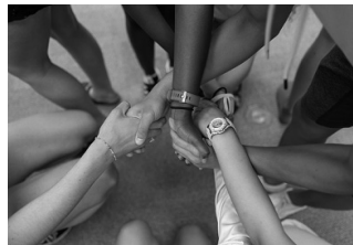
Human puzzle links