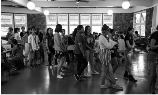
Lunch at Punahou