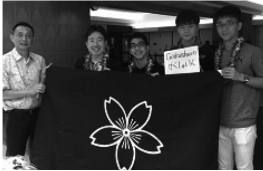
Oyukai in Hawai'i 1