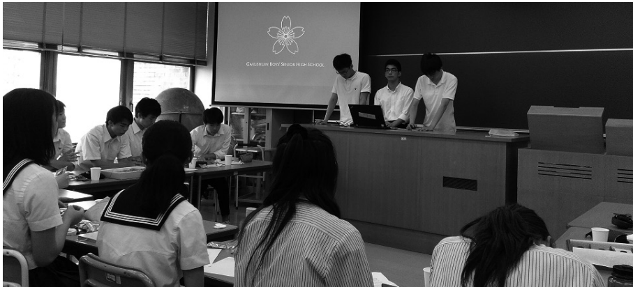
Preparation session 1

We had a preparation session with students from other schools in Japan, Gakushuin Girls' Senior High School, ICU High School, Keio Shiki High School, and Fukui High School in Gakushuin Boys' Senior High School in June, 2019.