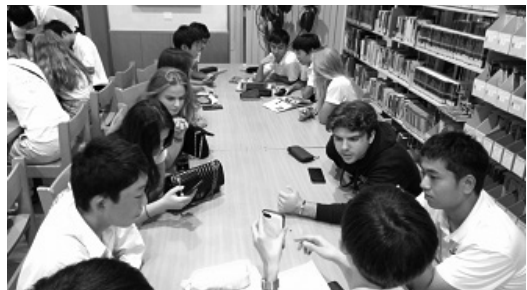
Talk on Fukushima Nuclear Power Plant No.1 & Tokyo Sightseeing spots