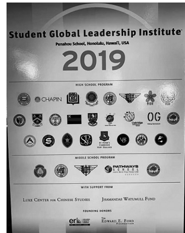
SGLI 2019 school seals