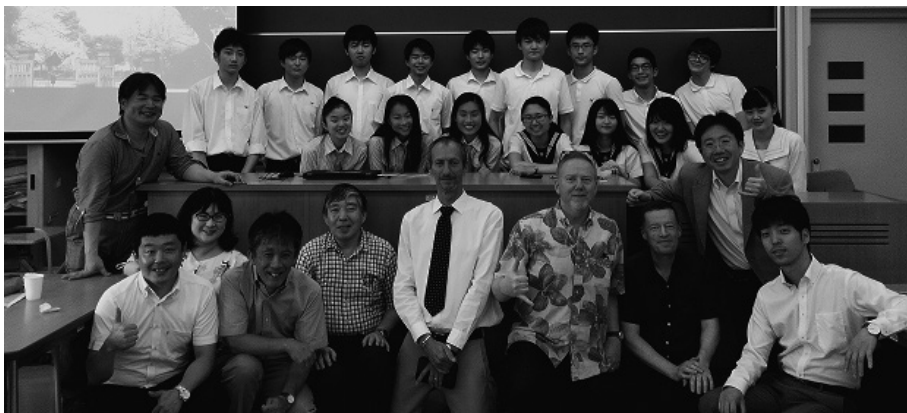
Preparation session 2

Team Japan played a great role in the Talent Show at Punahou School. They showed Algorithm Physical Exercise, Blind Samurai Battle, and Baton Twirling in front of the 100 students and teachers. Algorithm Physical Exercise is a unique exercise in the popular educational TV program called Pythagoras Switch. They practiced very hard to make their motions synthesized.