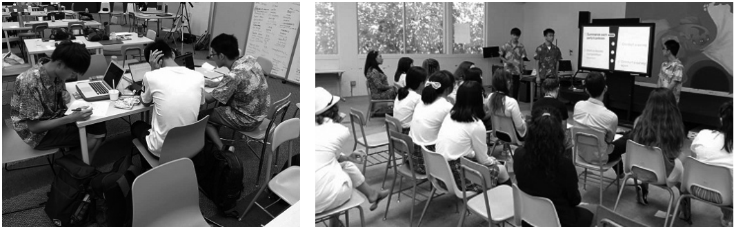
Preparation & Final presentation

The three from Gakushuin Boys’ Senior High School had carried out discussions on the theme Moral Courage, covering topics like refugees, bullying, and elections. They finally settled on the idea of an activity to raise awareness of elections among high school students. They made their final presentation successfully. The concise version of their presentation ( 1min.) was recorded and we can watch it on the Internet.