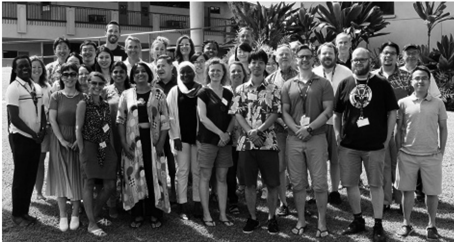
Teachers in Global Educator Strand