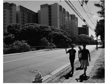
UH Manoa Dorms

We participants need to remember what the purpose of SGLI is every time we join. The Punahou School's website says: