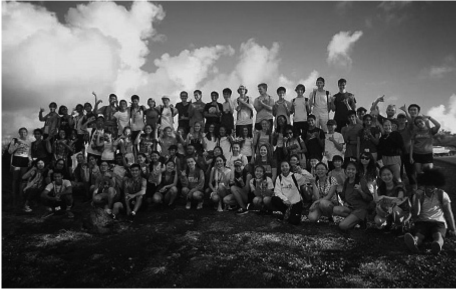
Makapu'u Lighthouse trail hike