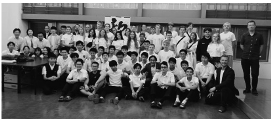
Group photo 2